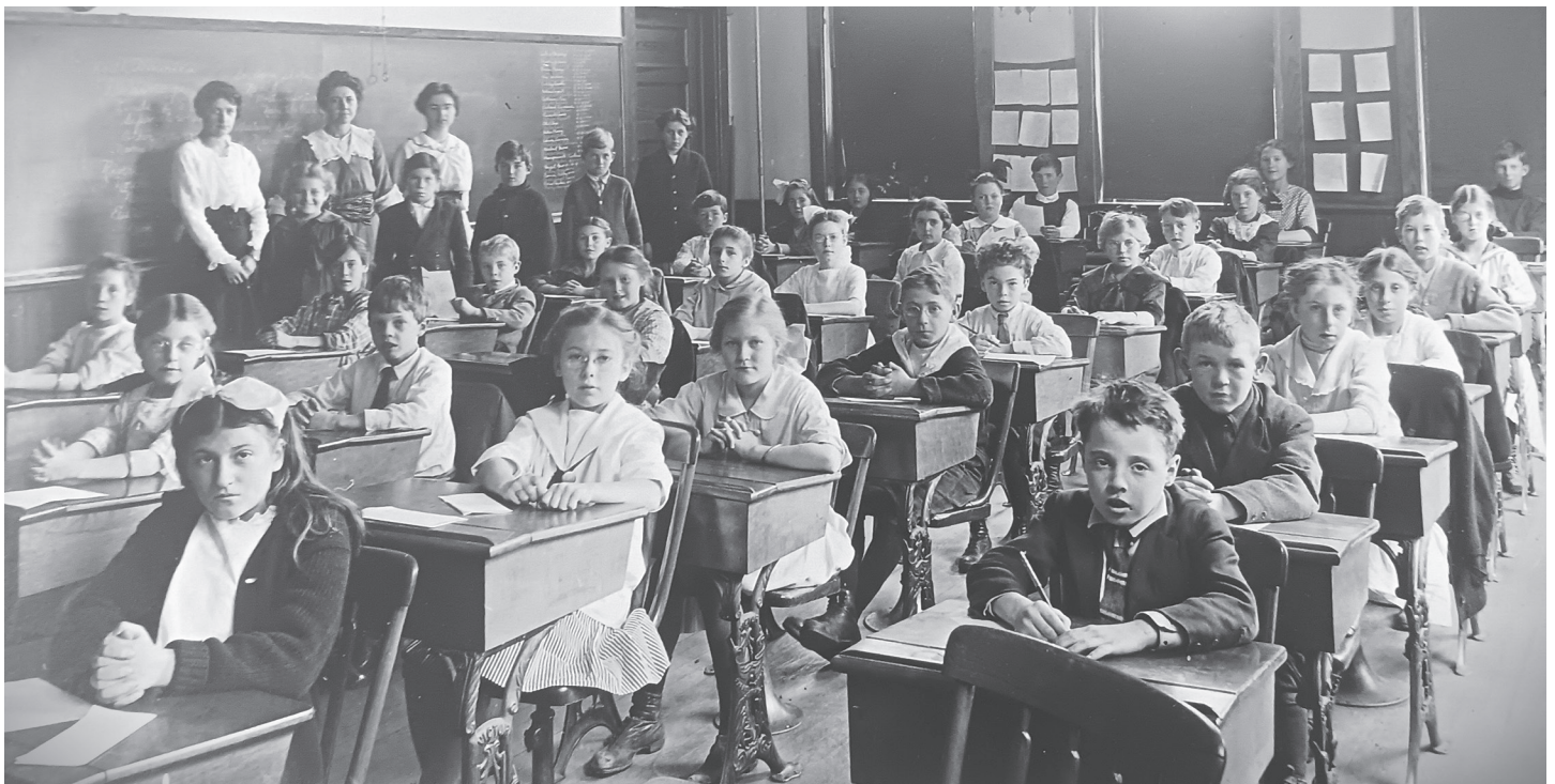
1914 model classroom