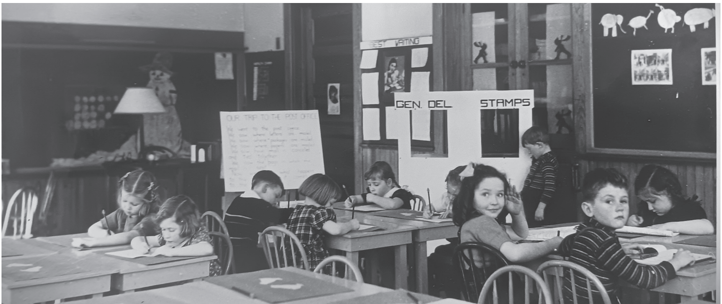
1940 model classroom

photographs of finely dressed young men and women standing or sitting in rigid, regal poses (and usually without a smile) that were the standard of those years. As the early decades of the 20th century wore on, photography became more common, affordable, and portable. Students at E.S.N.S. were able to document and share their experiences through personal photographs which tell us students spent their time outside of school visiting Dyce Head lighthouse, hiking in Witherle Woods, and going on picnics. Like today, people living in Castine took advantage of the beautiful landscape. One of the latest photographs of a class from E.S.N.S. is a 1941 photograph of a relaxed picnic at the principal's house. Looking through these photos, we can get a sense of the Eastern State Normal School as more than just a place of learning—it was a place that students enjoyed.