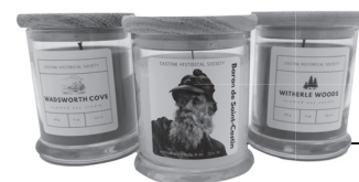
Exclusive jar candles

Check out and shop for merchandise by going to our website's homepage, www.castinehistoricalsociety.org , and clicking on SHOP in the menu. We can ship anywhere, or you can arrange for local pickup. You can also order by calling us at 207-326-4118. Don't forget all current members get a 10% discount by typing MEMBER in the coupon box.