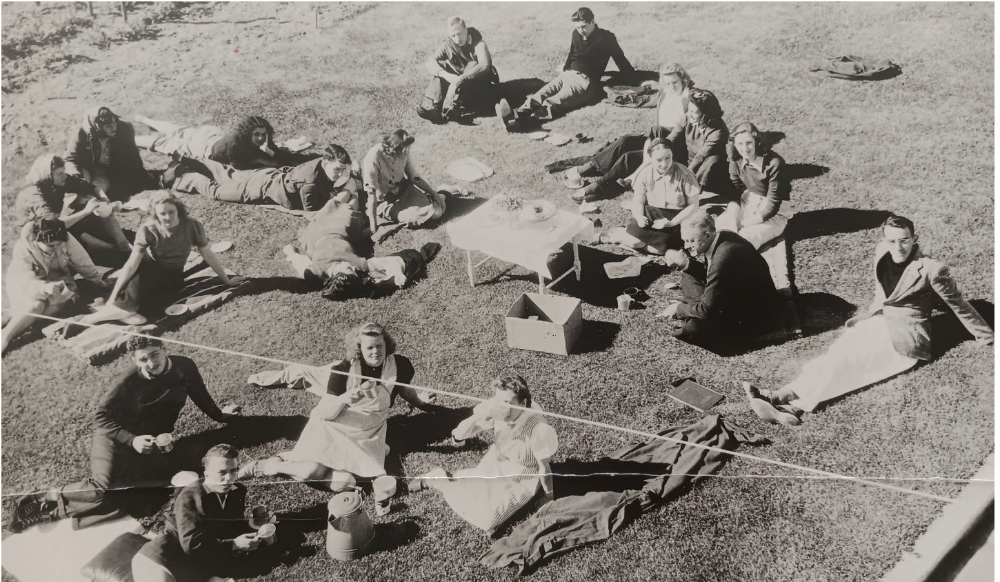
Picnic at Presidents Hall