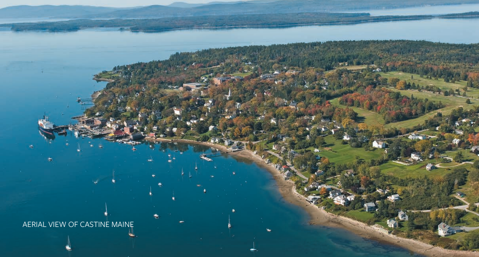
AERIAL VIEW OF CASTINE MAINE