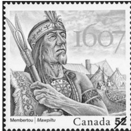
Membertou, Mi'kmaq chief and the first native to be baptized in New France

When the fog lifted, the Frenchmen realized they were near Pemetiq (now Mount Desert Island). The captain took refuge in a harbor on the eastern side of the island (perhaps Newport Cove, at Sand Beach), and everyone gratefully disembarked. Soon a group of natives approached the Frenchmen. Some of them recognized Biard from the gathering at Pentagoet two years earlier, and the priest greeted them. He told them he wanted to settle at Kadesquit and asked for the best route there. The natives responded by telling Biard that their village was a much better place and he should settle near there. When Biard was unmoved, the natives then said that their chief, Asticou, was deathly ill. They told Biard