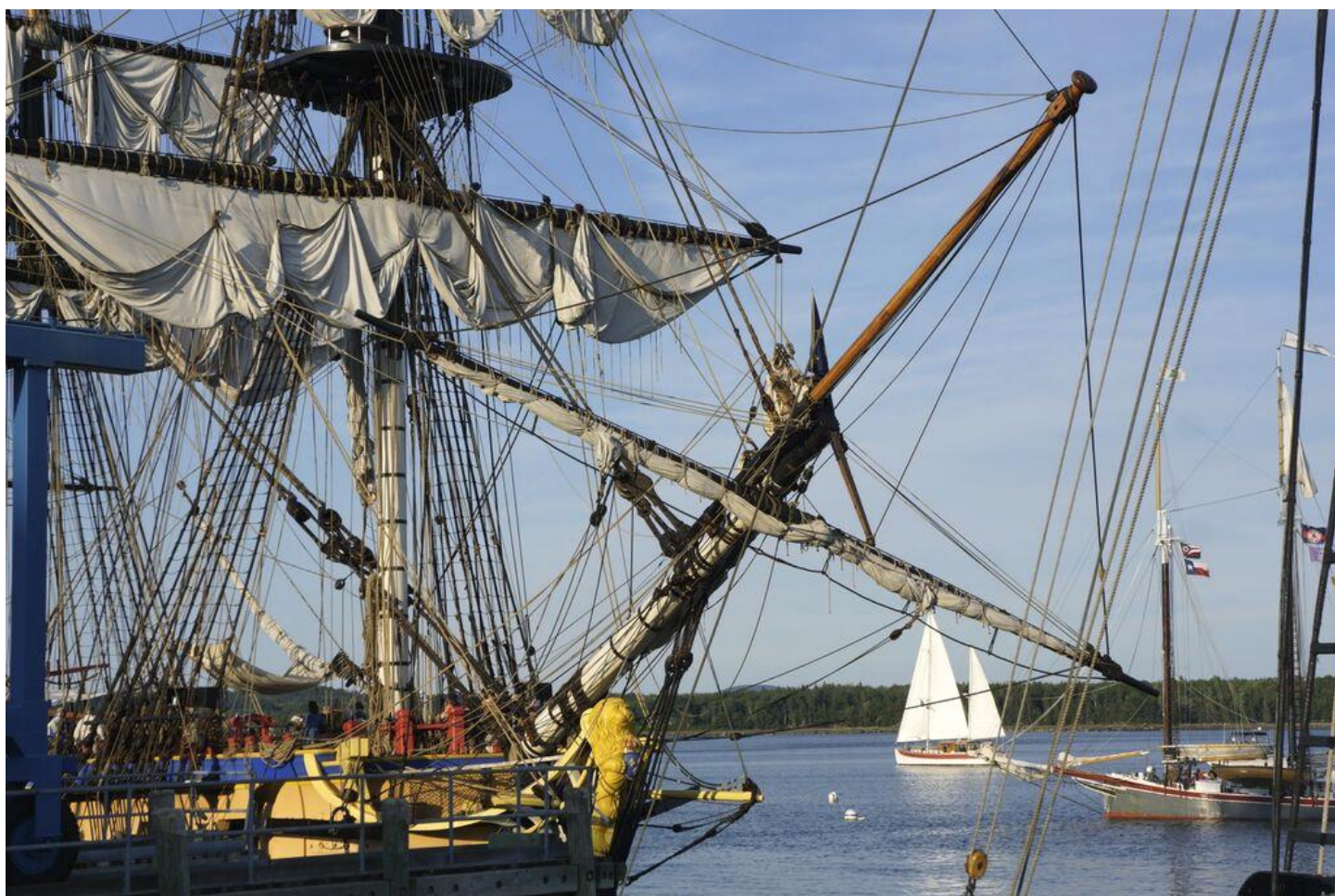
Hermione in port at Castine, July 14-15, 2015

U.S. Postage Paid Permit No. 76 Non-profit Bangor, Maine