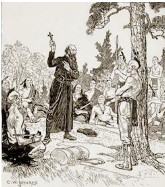
“A Jesuit Preaching to the Indians,” by C.W. Jefferys (1869-1951)

Penobscot sagamore had told the French explorer that his people were welcome to live in Mawooshen.